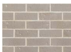
Sculpted Grey (Medium)