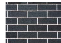
Blue Gum (Dark)