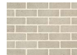
Silver Birch (Medium)

It's the subtle depth and variation of colour that's captured in every brick that brings this range to life. Inspired by the beauty of Australia's wilderness, these bricks make a dramatic visual proclamation when contrasted against modern building materials.