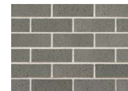
Grey Gum (Dark)