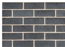
Urban Blue (Medium)