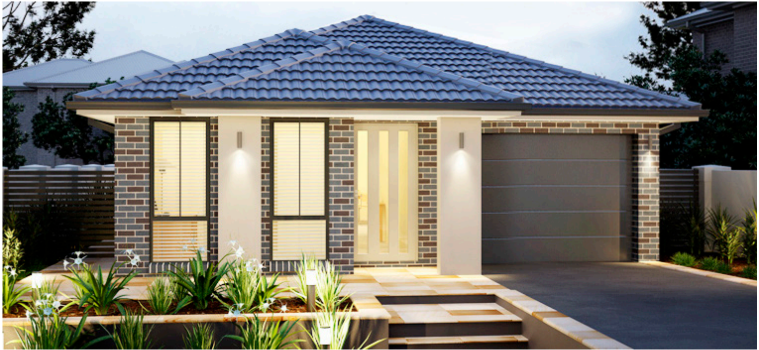
ARTIST IMPRESSION ONLY. ASPEN FAÇADE AS ILLUSTRATED.