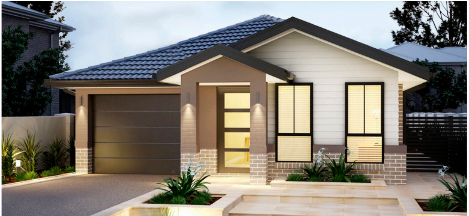
ARTIST IMPRESSION ONLY. NEW TRADITIONAL FAÇADE AS ILLUSTRATED.