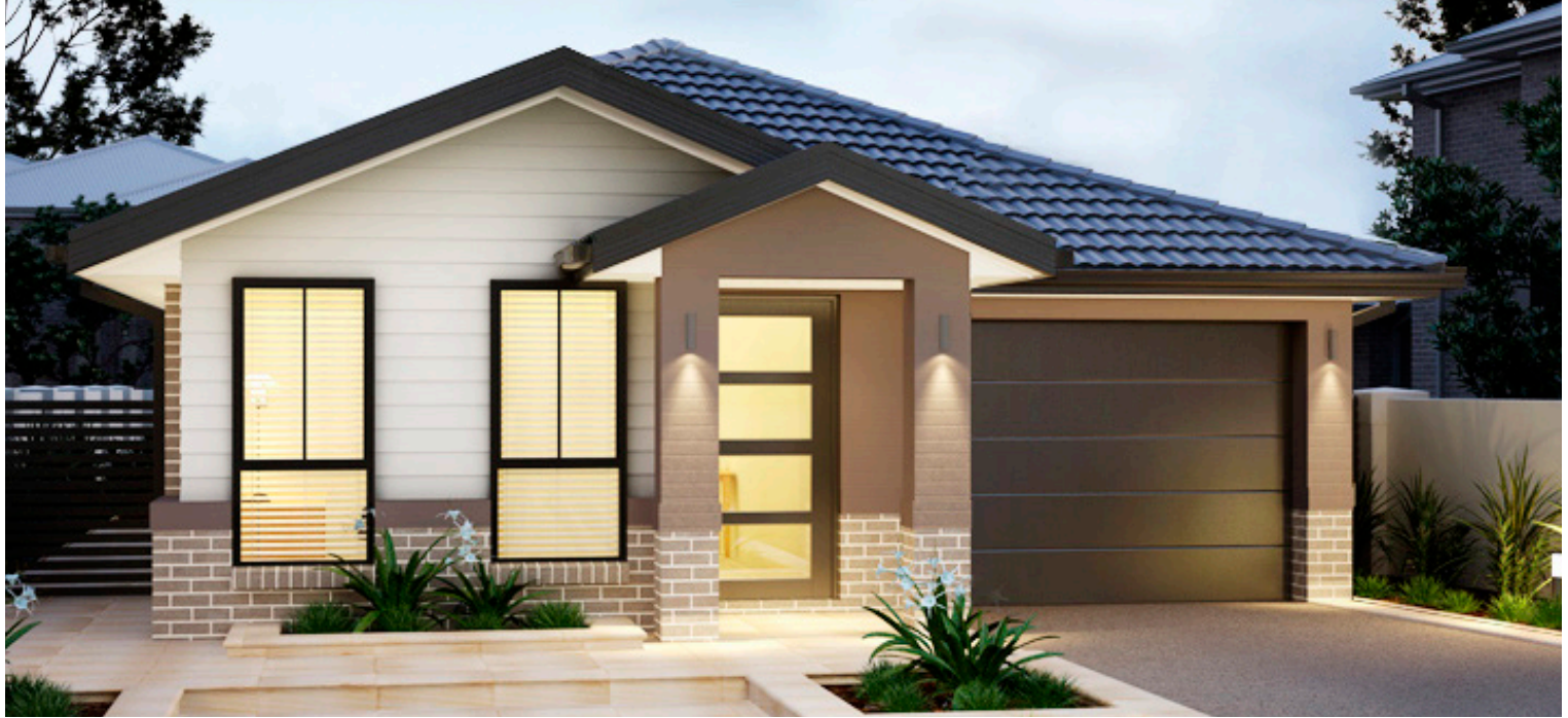
ARTIST IMPRESSION ONLY. NEW TRADITIONAL FAÇADE AS ILLUSTRATED.