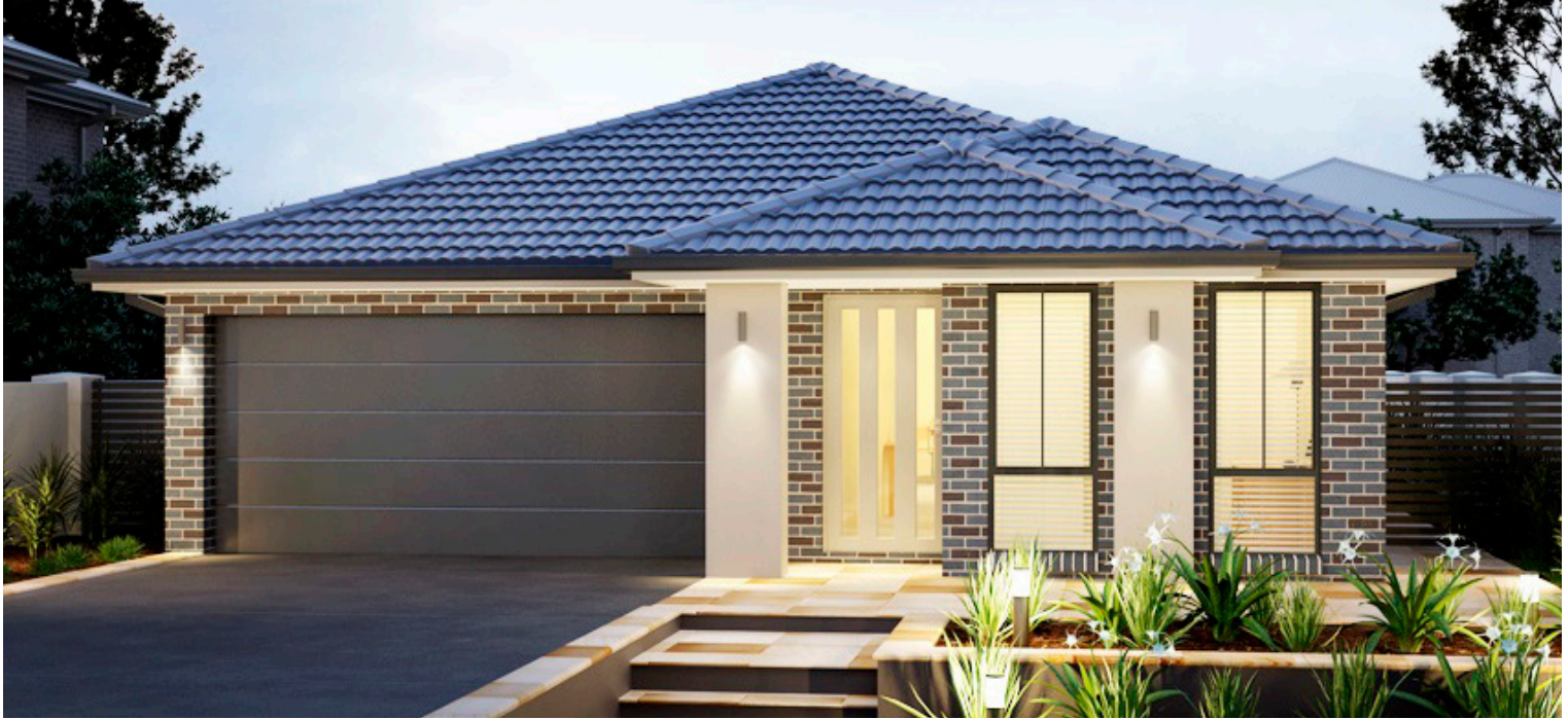
ARTIST IMPRESSION ONLY. ASPEN FAÇADE AS ILLUSTRATED.