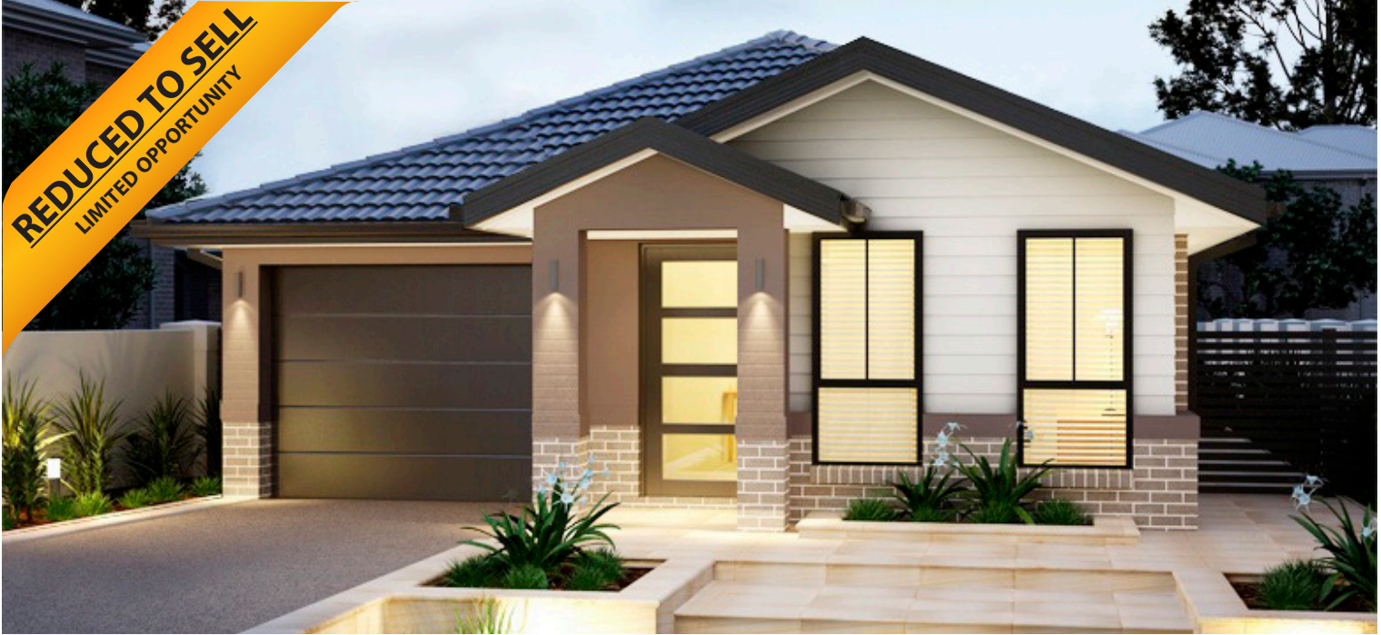
ARTIST IMPRESSION ONLY. NEW TRADITIONAL FAÇADE AS ILLUSTRATED.