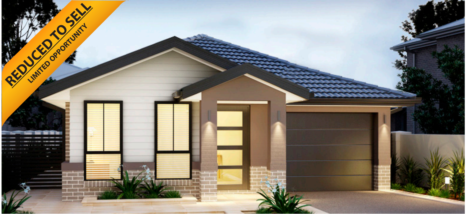
ARTIST IMPRESSION ONLY. NEW TRADITIONAL FAÇADE AS ILLUSTRATED.

SOMMERSET 17.8 MOD ZERO LOT LAND SIZE: 341.5m 2 | SQUARES: 17.8 Sq