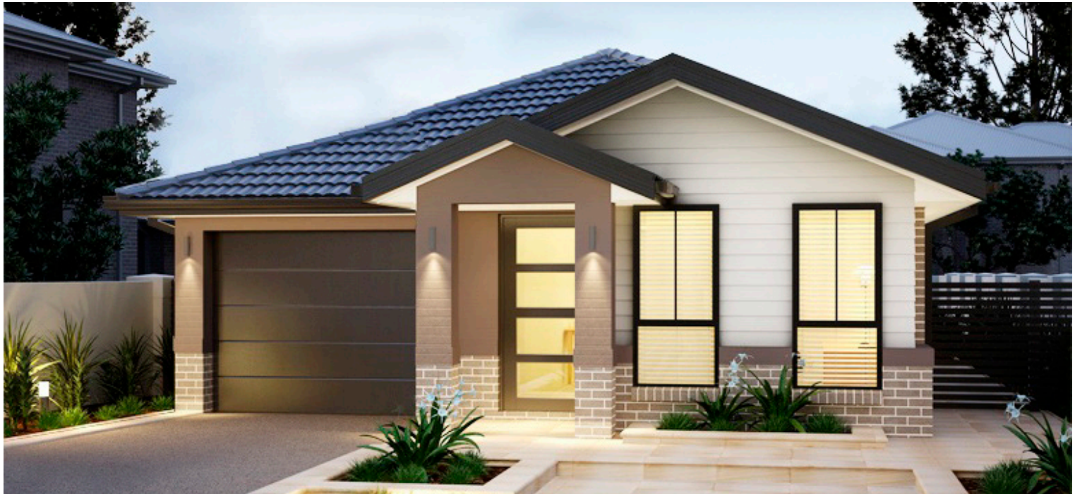
ARTIST IMPRESSION ONLY. NEW TRADITIONAL FAÇADE AS ILLUSTRATED.

SOMMERSET 16.7 ZERO LOT LAND SIZE: 310.5 m 2 | SQUARES: 16.7 Sq